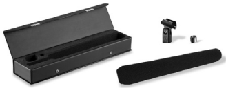
frequency response: 40–20,000 Hz

Specifications are subject to change without notice.